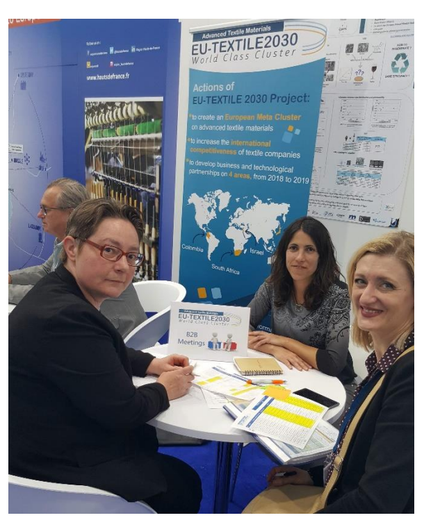
AEI Tèxtils, Po.In.Tex and Up-Tex/Clubtex, organizing the meetings between their members

During Techtextil, AEI Textils' members had the opportunity to participate in B2B meetings with companies from other clusters that are members of the European cluster of advanced textile materials, <u>EU-TEXTILE2030</u>. In total, more than 50 B2B meetings took place.