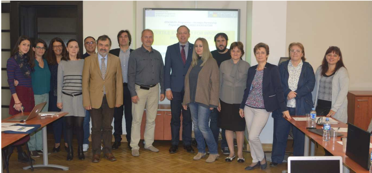
TEXSTRA team with KTU rector at the opening of the project meeting

The objective of these actions is to promote and transfer research and innovation using e-learning tools for students and professionals by project-based learning, contributing to an efficiency and competitiveness boost among small and medium textile companies in Europe.