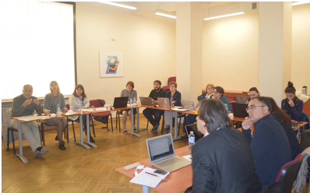
TEXSTRA team during the project meeting in Kaunas